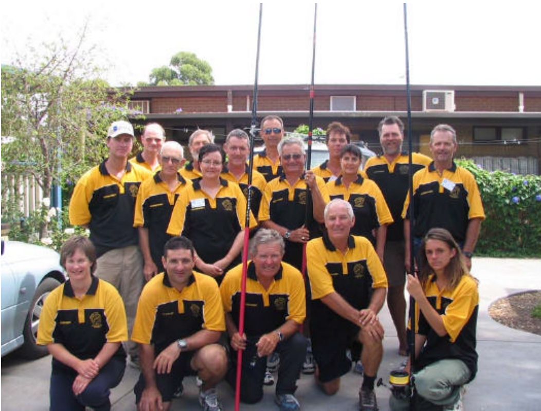
The Surf Casters