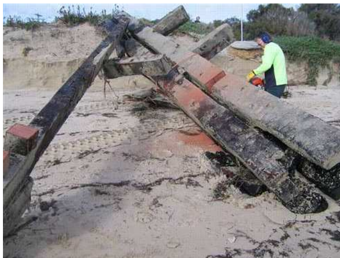
Big timber! Some of the pieces of the jetty washed up on the beach.

Does this mean that the people that didn't want the end of the jetty repaired, and would exclude