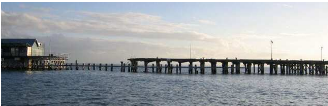
The missing bit - Underwater Observatory building on the left, end of the jetty on the right.

recreational anglers from this section, have won the day - courtesy of "Mother" nature? "Mother" was in an angry mood that day.