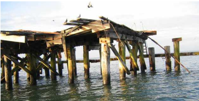
Landward end of the remainder of the jetty - looking north east.

He said the underwater observatory didn't have the steel cover on the window closest to the surface. Who knows if the deeper windows have been damaged?