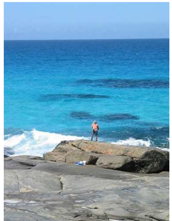
Cookie rock fishing into reef holes for Skippy.

There are kilometers of open beach for fishing. Some reef fishing spots are within easy distance of the camping area. You