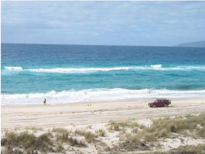
Miles of beaches like this !!!!

DO NOT MISS THIS FIELD DAY!! . If you don't own a 4WD then ask another member for a lift. This is a FAMILY