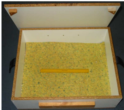
The melamine box.