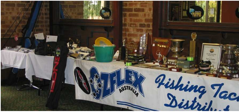
Trophies and prizes on display.