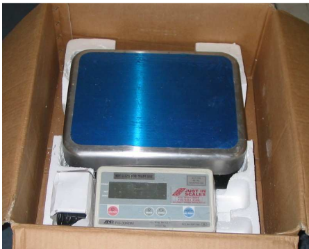
The scales as received.

A box was made from 16mm melamine board. This is very strong and protects the scales from any chance of damage from any forces on the top of the scales via the lid. In fact, the Reel Talk Editor demonstrated he could jump up and down on the lid of the box without causing any significant bending or any ominous noises.