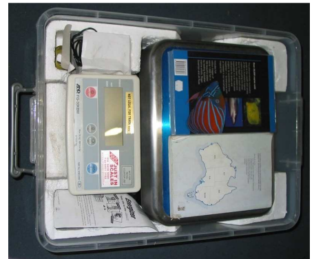
The plastic container

Yes, this melamine box was probably an overkill, and at 7.3 kg was heavier than it needed to be, but it was very strong and it was made to be available in time for the late February/March Bluff Creek Field Day.