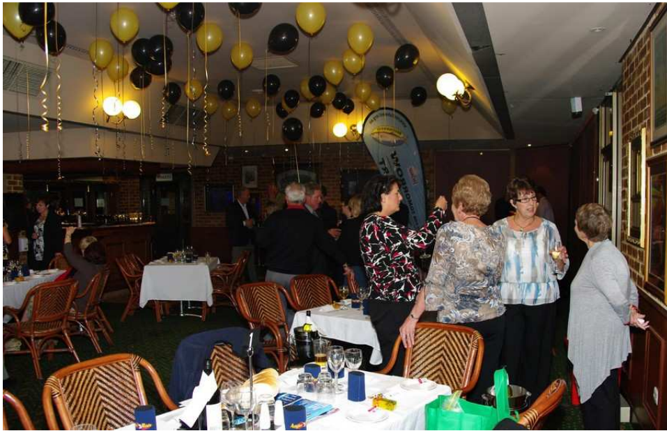
The room at Glengarry Tavern.