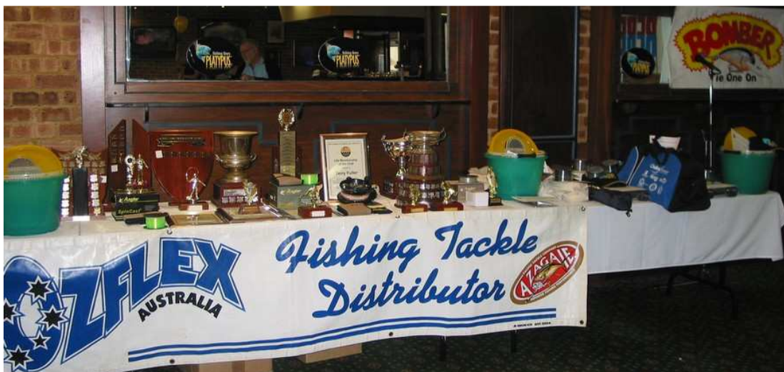
Trophies and prizes on display.