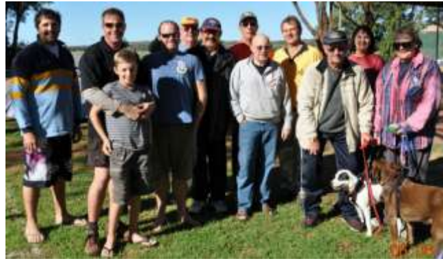
The team at S-Bend

As always a number of keen fishermen from Perth or even further south tow up trailers loaded with quad bikes. They searched various out of the way places not accessible by 4WD but only found weed.