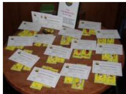
Barron lures, species badges, club records, free membership