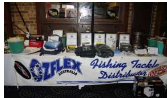
Prizes, certificates and trophies on display