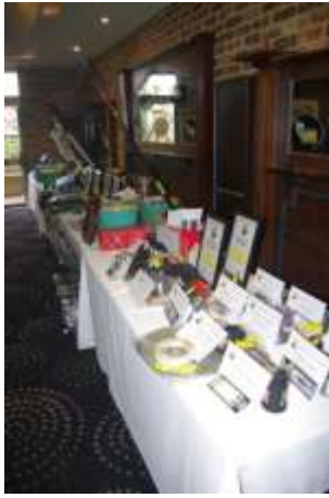
Prizes, certificates and trophies on display