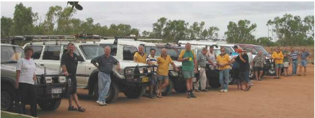
Surfcasters line up at the Minilya roadhouse for morning tea.

Upon arrival at Minilya, all the vehicles pulled up in a row in the large carpark area, so out come the cameras.