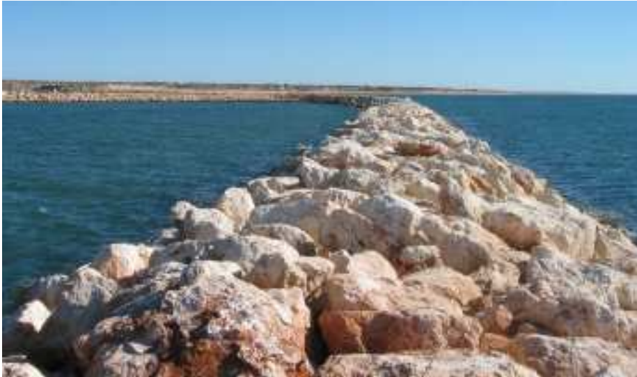
The trek out and back on the north wall is over these rocks, to the car park at the end of the curve. The white stuff is lots of powdery birds' doings, which makes walking on the rocks in sneakers a bit of a challenge. Reef boots are great here.

Prime fishing time had come and gone so we all headed back along the marina wall to where we had parked our vehicles. Precarious rocks necessitated careful maneuvering to get back in one piece.