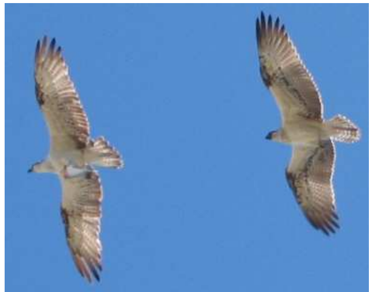
Ospreys floating in the breeze near Seabird, showing off the catch.

Back at the river mouth, the boys were on the beach hoping for an early run of tailor. For most of the afternoon, the weed was more of a nuisance than a real problem. The drift wasn't very strong, and the weed came past slowly and in patches, and you just needed to watch where you were casting. If you waited for the patches to drift past, and cast into a relatively clear stretch of beach, there was no problem with the rig staying in the water. The weed you would get could be handled easily with the beach rods and Alvey reels. Some of the guys with lighter rods and threadline reels were finding the going a lot tougher.