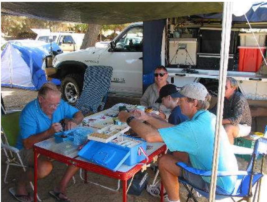
Rig making session for visitors.

With the 10 pm and 10 am weigh in done it was time to leave, so I take this opportunity to say thanks to all who attended and made it another enjoyable weekend. My visitors were impressed with the comradery and enjoyed themselves immensely.