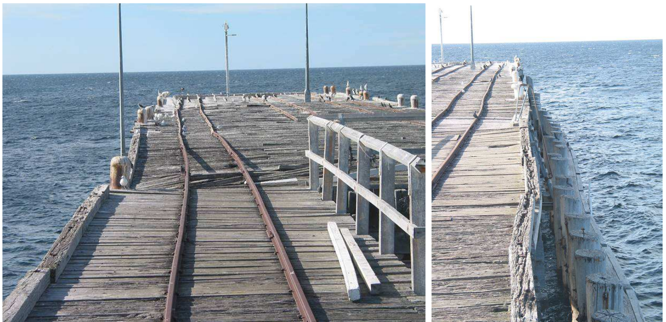
The end of Busselton Jetty. How many more winter storms will it survive?