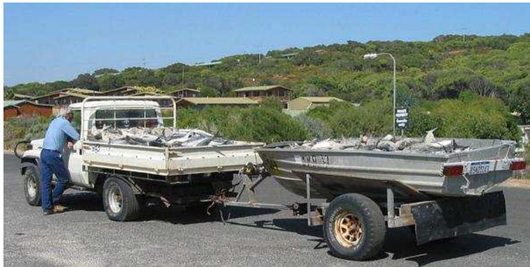
"Temperature controlled high quality fish transports"

Salmon on the 4WD and in the boat had been rolling around in the surf or