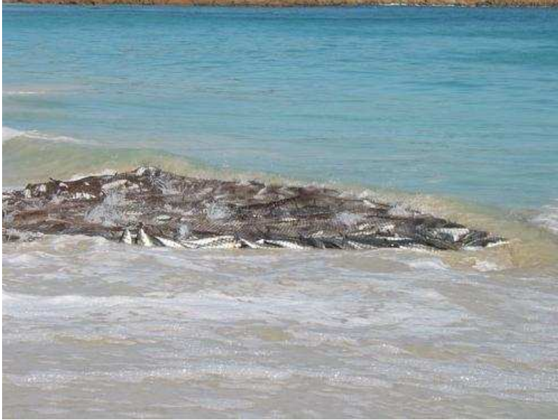
Rolling around in the surf.

So the 2002 recreational catches on the South Coast would have been about 30,000 salmon and West Coast recreational catch would have been between 12,500 and 25,000 salmon.