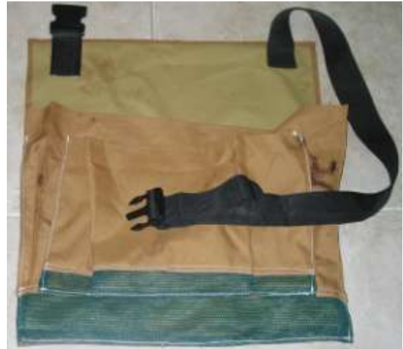
Shade cloth drains and quick release clip.

Now the bag drains from full of water to empty in about 1 second.