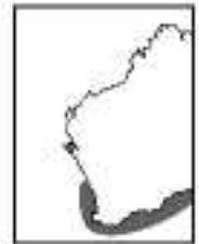
Bronze Whaler details - an example from the booklet.