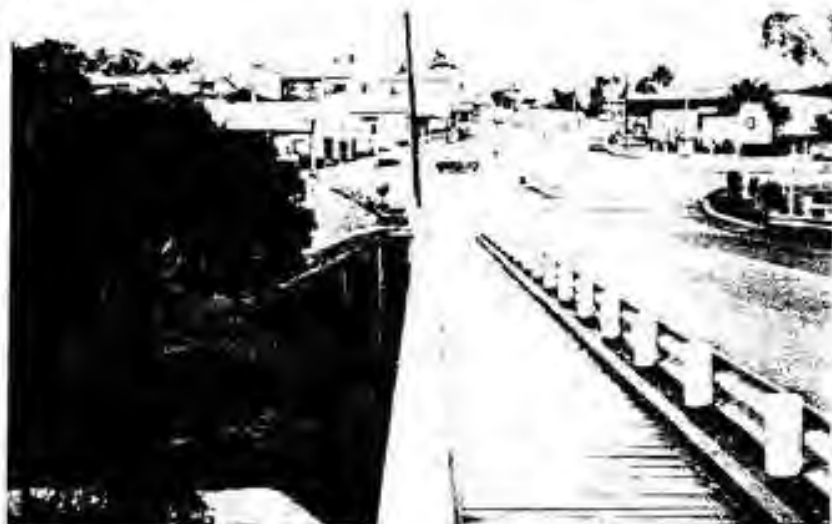
Town Centre — Denmark.

In 1922 the 'group settlement scheme' brought some 250 new families to the district and agriculture has progressively strengthened since this time.