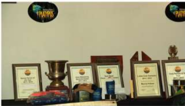
Club awards and certificates