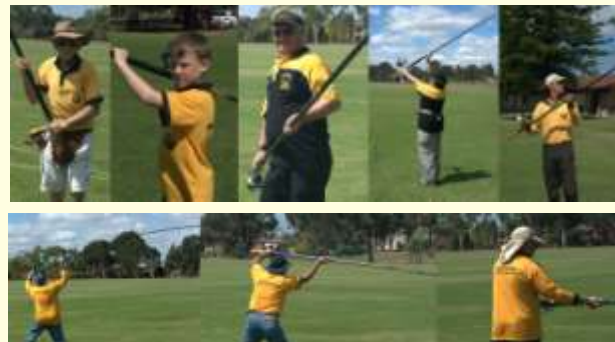
Club members at Dry Casting

Social Events - the club conducts social activities during the year, culminating in June with the annual dinner and trophy presentation night.