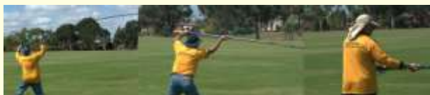
Club members at Dry Casting