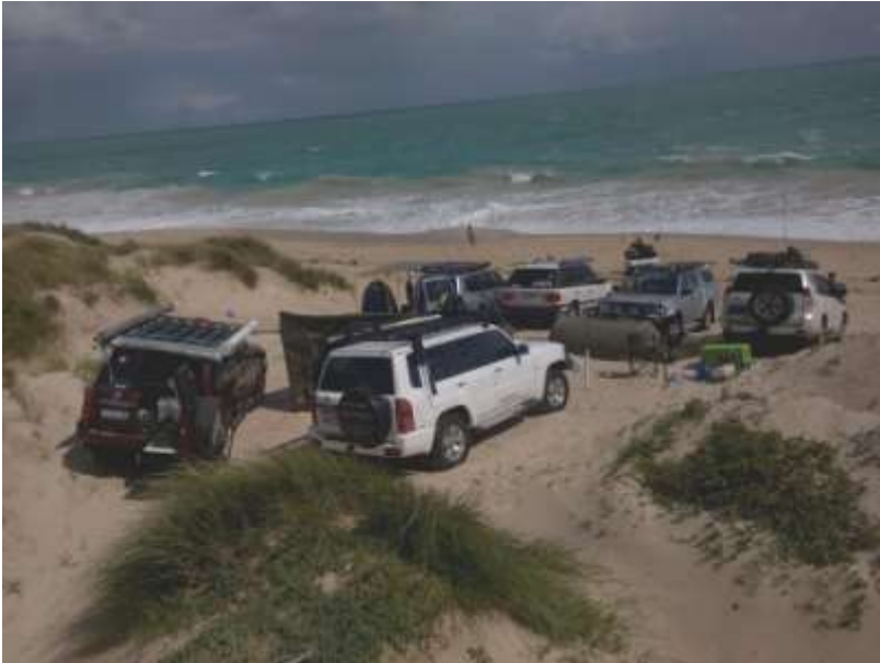
The spot at Preston